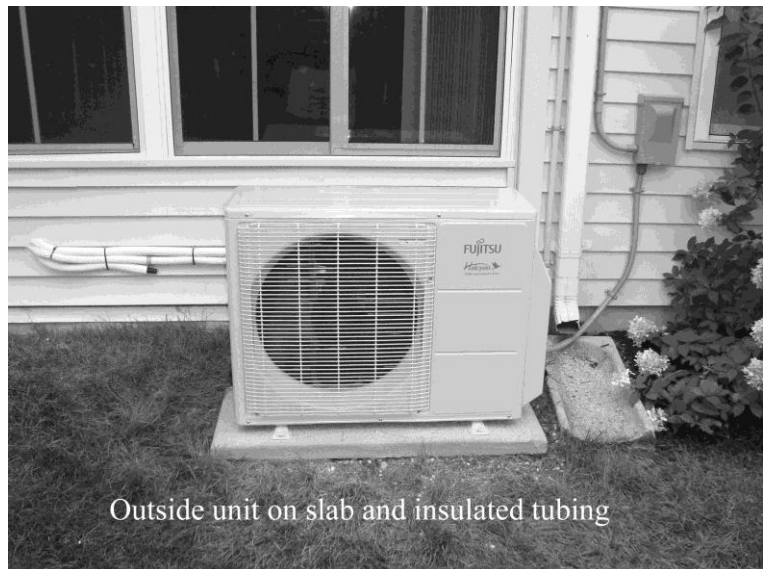
Outside unit on slab and insulated tubing

conditioner/heat pump units called 'split units'. They are similar to the whole house units we all have but are made to do one room. The air handler/evaporator is mounted on a wall in the room as shown above and the suction and high pressure tubing for the Freon is led outside to the